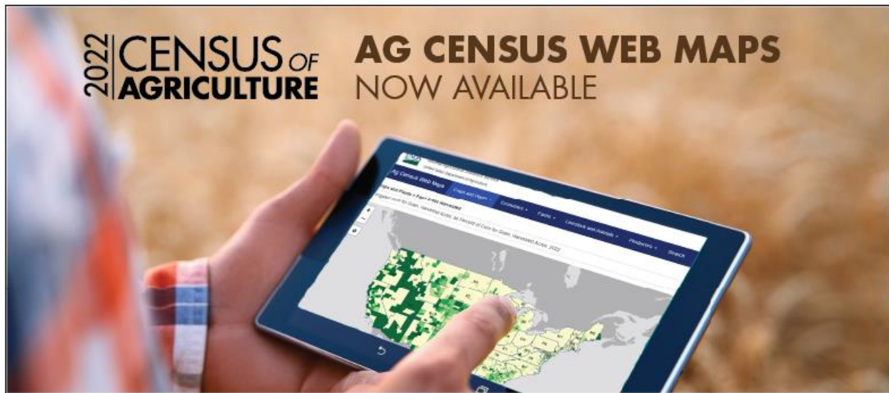
Ag Census Web Maps application